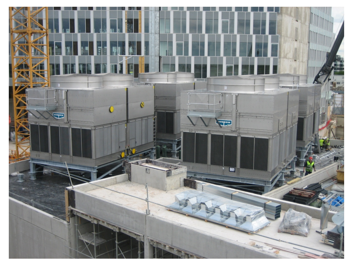
View of the (4) UAT 224-318 double cell cooling towers after rigging

Moreover, the water loops run at variable speed, down to the limit of 50%, at partial load. This improves further the global system efficiency on a yearly base. The AT range with the patented EvapJet<sup>TM</sup> nozzles can cope with such variable flow, while our competitor with gravity feed box water distribution cannot guaranty proper operation under such conditions.